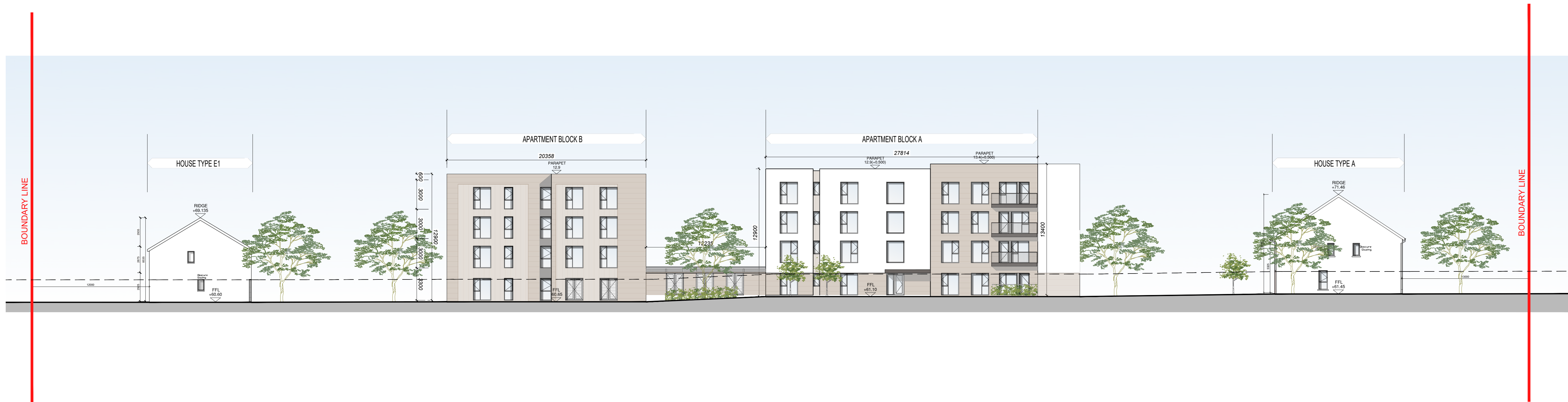
02 SECTION H - H SCALE 1:200 @ A0