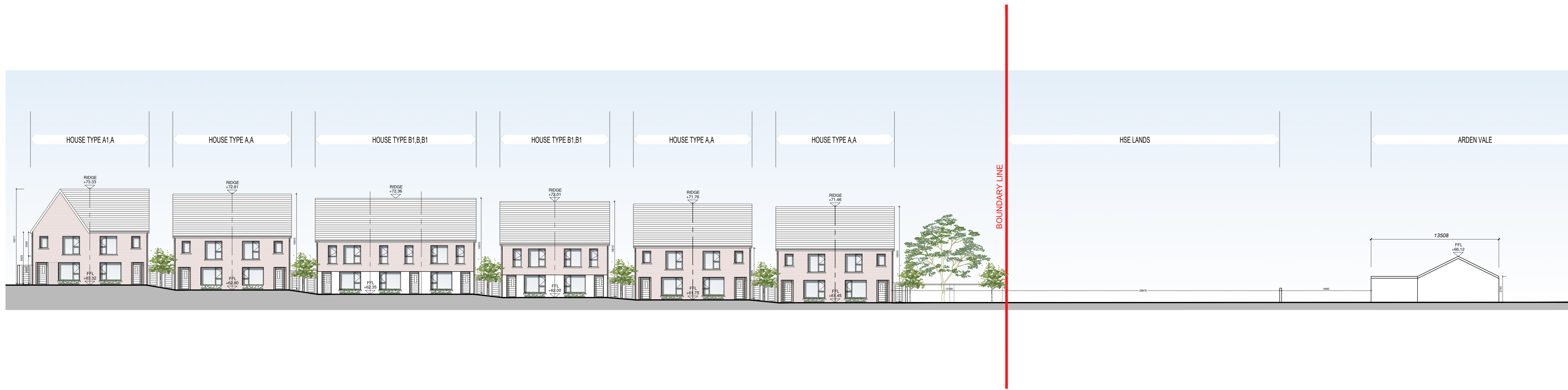
01 SECTION G - G SCALE 1:200 @ A0