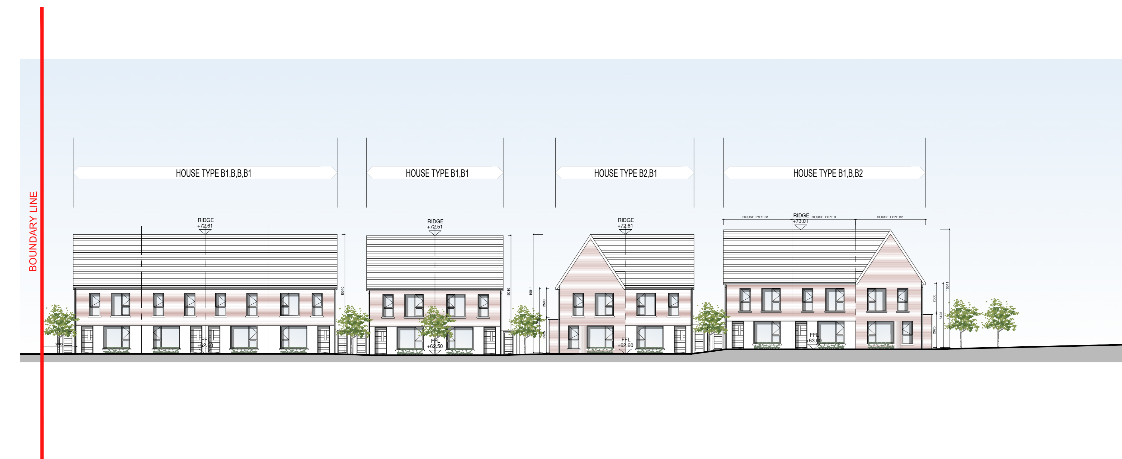
03 SECTION I - I SCALE 1:200 @ A0